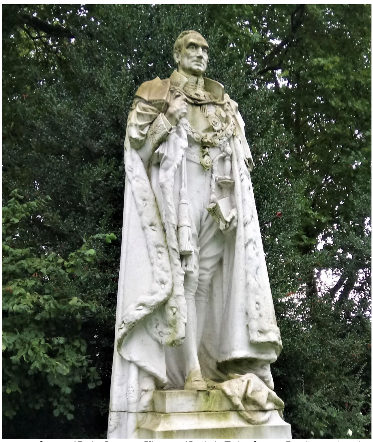
Statue of Rufus Isaacs as Viceroy of India in Eldon Square, Reading

The Liberal decline continued in the 1922 election, when, following the national trend, a new Conservative candidate<sup>9</sup>, Edward Cadogan, with 16,000 votes gained a majority of 1,760 votes over the Labour candidate. Then came the 1923 election which saw the election of Reading's first Labour MP, Dr Somerville Hastings with 16,657 votes and a 1,542 majority over Cadogan. Here again Reading